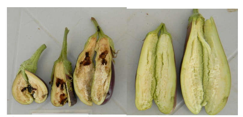
Figure 3. Non-Bt eggplant